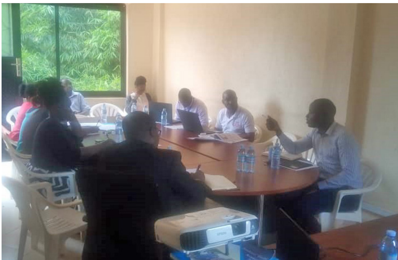
Participants at the inter agency meeting