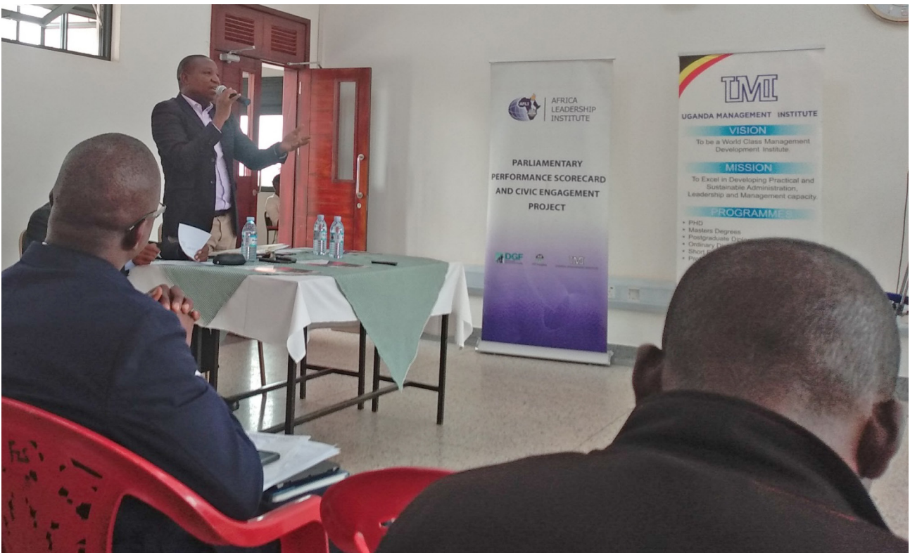
Mr. Moses Watasa, the Commissioner for Broadcasting and Communication makes a speech during the policy forum