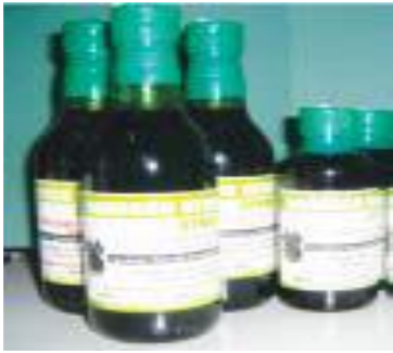
Sampled bottled herbal medicines (liquid form)