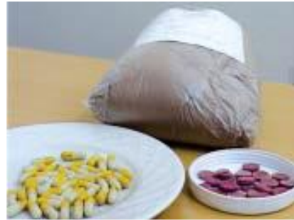
Herbal powders packing in different forms (powder, capsules (bottom left; tablets (bottom right).